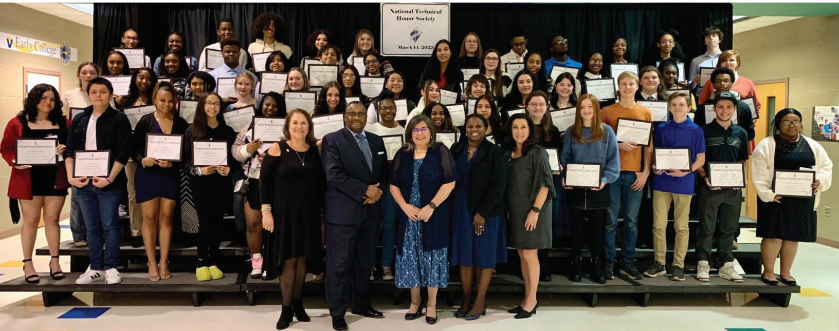
McKenzie Center Honors NTHS Inductees (Read More Inside)